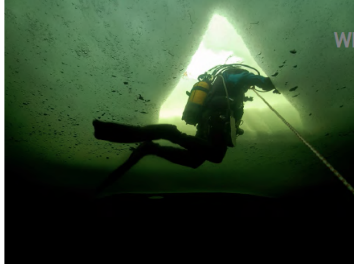
CLOCKWISE FROM FAR LEFT: Divers explore ice formations of Biofilter Bay; Divers enter and exit through the hole in the ice surface; Divers are secured to the surface using a system of ropes; Divers find clear, dark water beneath the ice