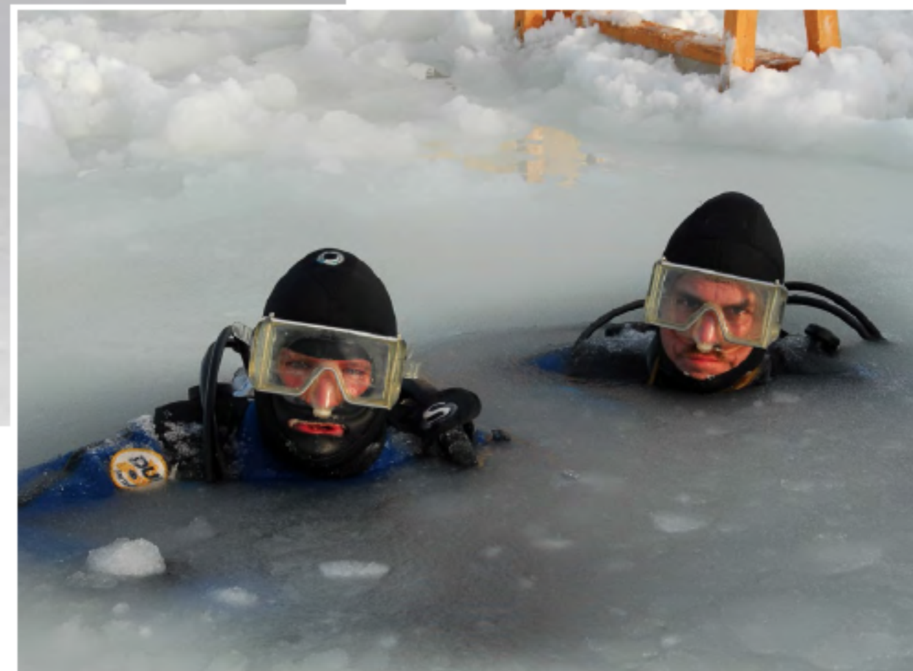
The authors entering the water

We gathered in the frigid pre-dawn hours, our gear and luggage piled in front of the snowmobiles and our noses freezing in the -22^{\circ}\text{F} ( -30^{\circ}\text{C} ) temperatures. It was time to be saying good bye to our Russian hosts after a week of diving the frozen White Sea but we were tempted to linger just a little bit longer. It was during these last few moments, as we stood under a curtain of stars on a deep, dark winter's night in Russia that we reflected back on the events of the past week.