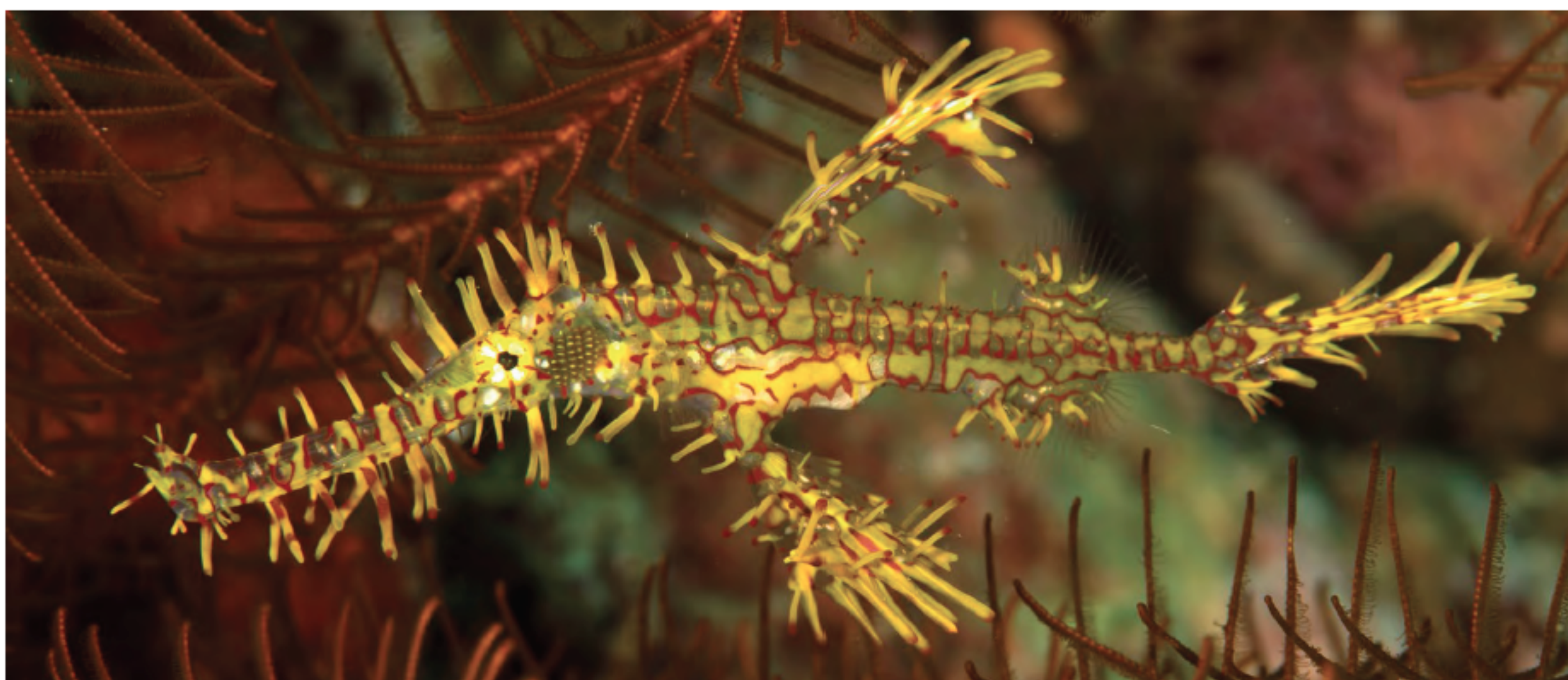
Ornate ghost pipefish, Anilao, Philippines.