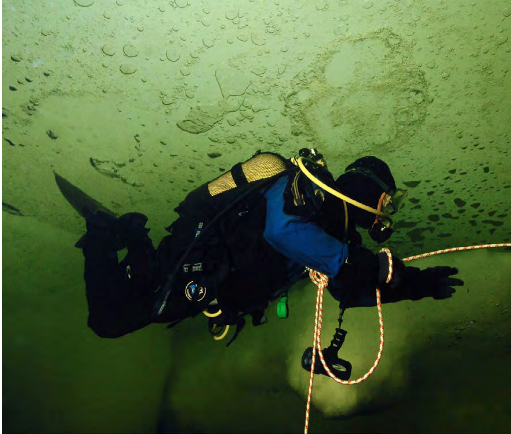
Divers find clear, but dark water beneath the ice.

Our first dives in the White Sea took us to a site known as "Anemone Rock". Here, in 45 FSW (14m), a huge boulder lies on the bottom, perhaps 20ft (6m) in height. This rocky outcrop rises up from the slope of Bolshoy Krestovy (Big Cross) Island. Some say it is as big as a three-story building and shaped like a dragon's tooth. The seabed is