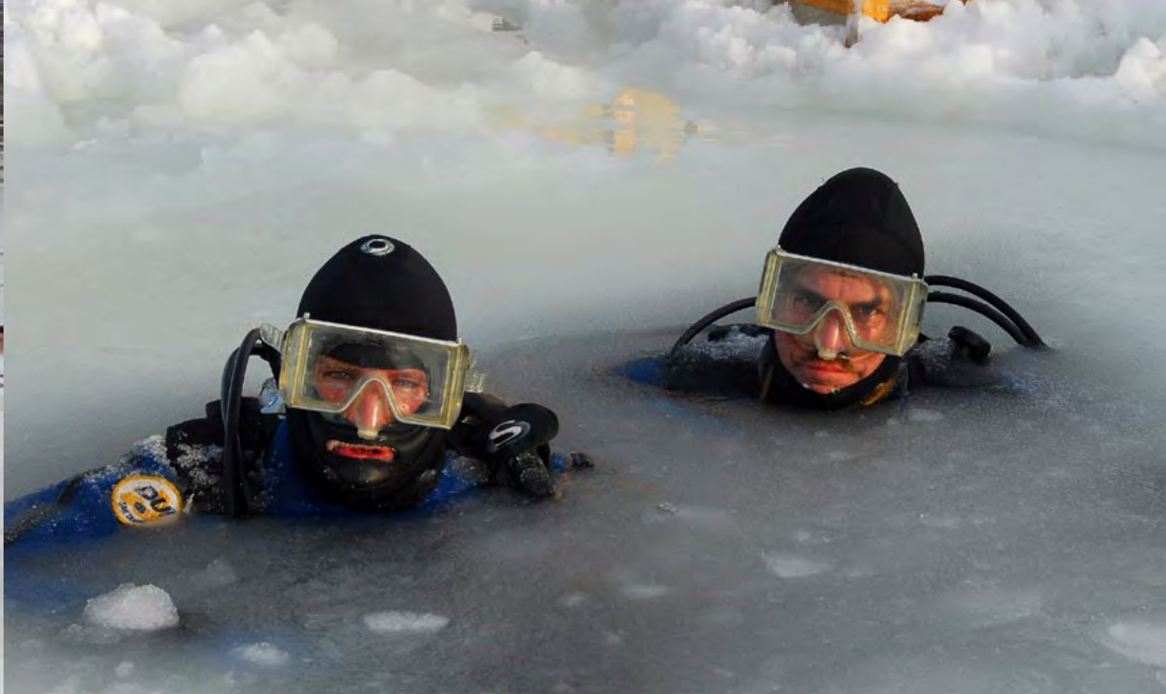
Of course, finding yourself in water so cold it is virtually "slush up" to your chin also sums it up pretty well. This is so much fun!

Diving the White Sea in winter requires preparation, equipment, fortitude and, most important, adequate training in ice diving techniques. With surface