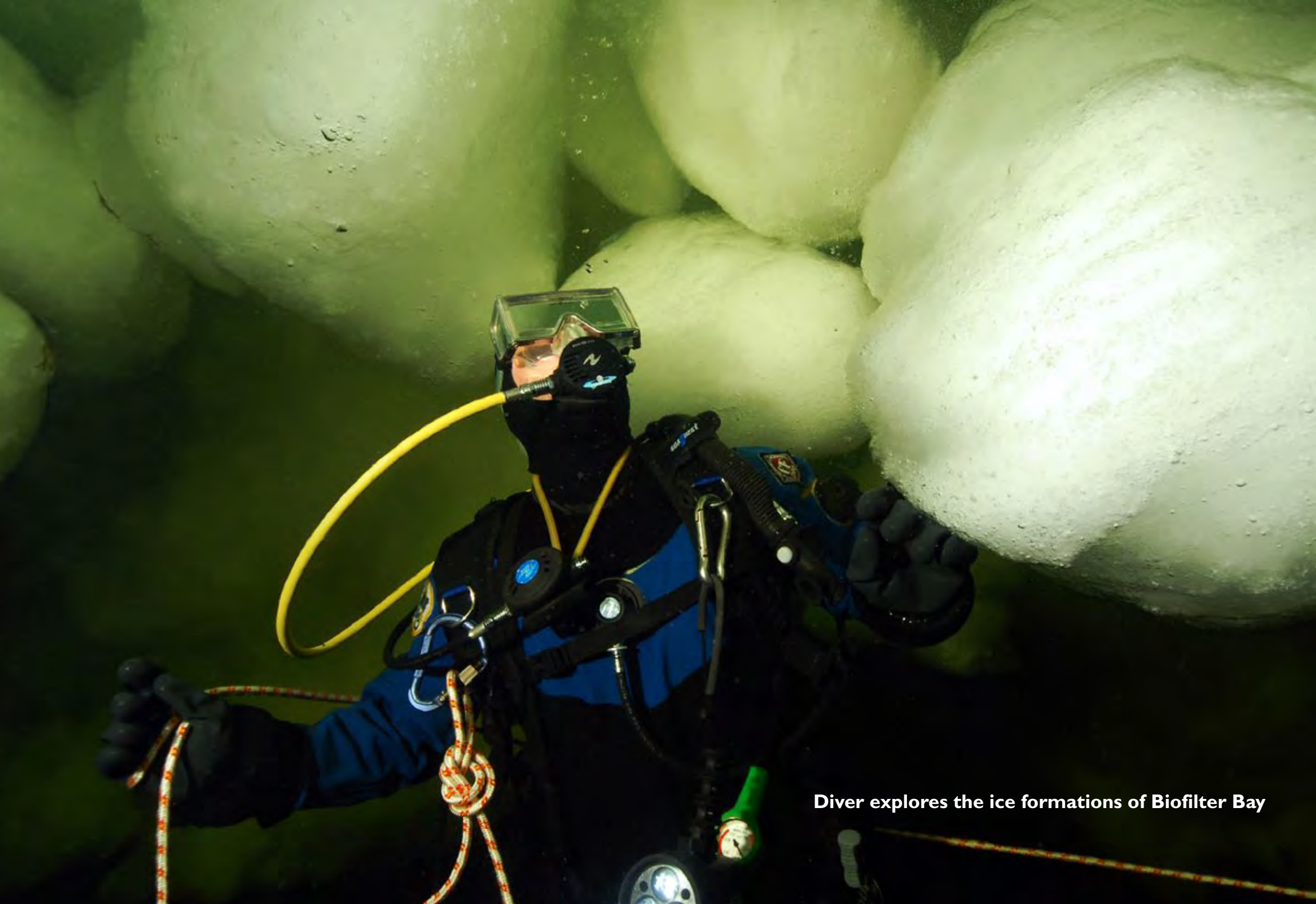
Diver explores the ice formations of Biofilter Bay