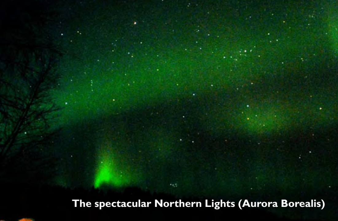
The spectacular Northern Lights (Aurora Borealis)