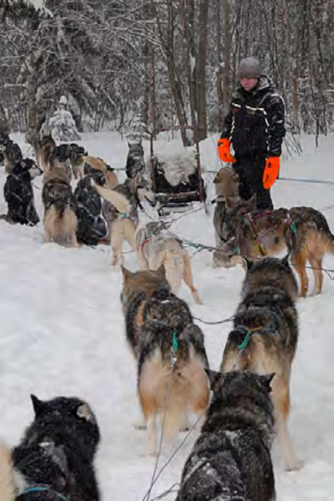
Nothing says you're going ice diving better than an exciting run through the Finish National Forest by dog sled!

Our base of operations for this ice-diving expedition was the Arctic Circle Dive Lodge, located near the seaside village of Nilma and just north of the Arctic Circle. To get here, we chose to fly to Finland, arriving in the alpine town of Kuusamo. After spending one day dog-sledding in a National Forest in Finland's fabled Lapland, it was time to