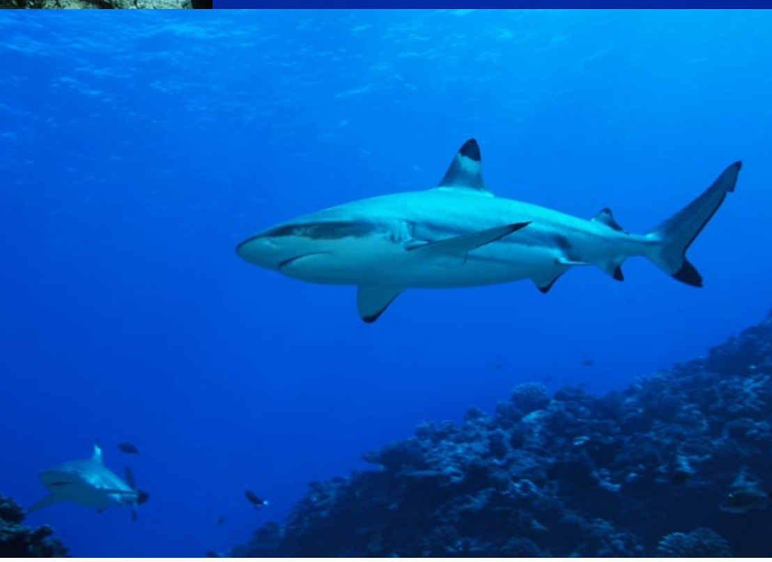
Life of the reef in Manihi range from raccoon butterfly fish (upper left), which often travel in schools to larger denizens like grey reef sharks (top) and blacktip reef sharks (bottom).

After only 5 minutes, they appeared from out of the gloom. First, a fleeting shadow could be seen moving cautiously among the murk. Then another shadowy glimpse, and finally there it was... the delta wing of a large manta ray sweeping past us like a jetfighter. Amazed, we stared with open eyes, while sucking down a few extra pounds of air in excitement. Soon we were surrounded! Manta Rays were everywhere, circling, dancing, sweeping, and flying all