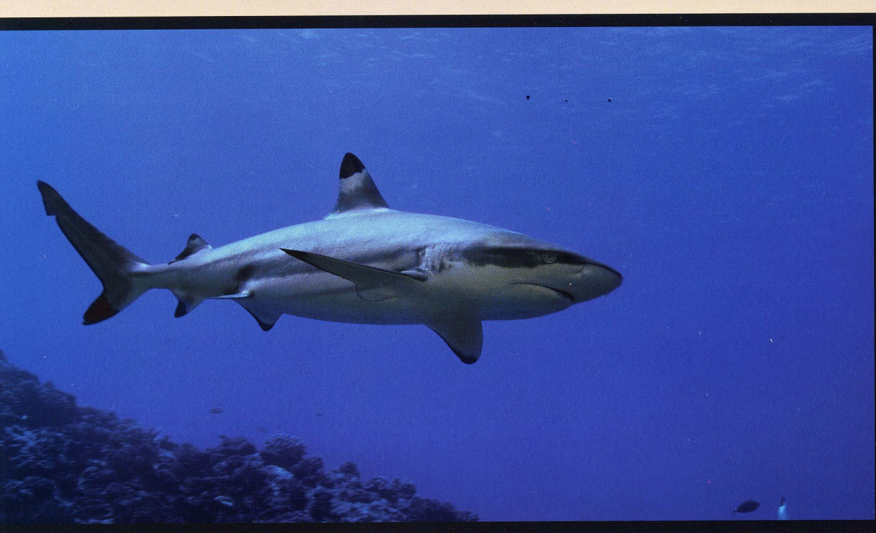
Pacific Blacktip Reef Shark in the waters of Bora Bora