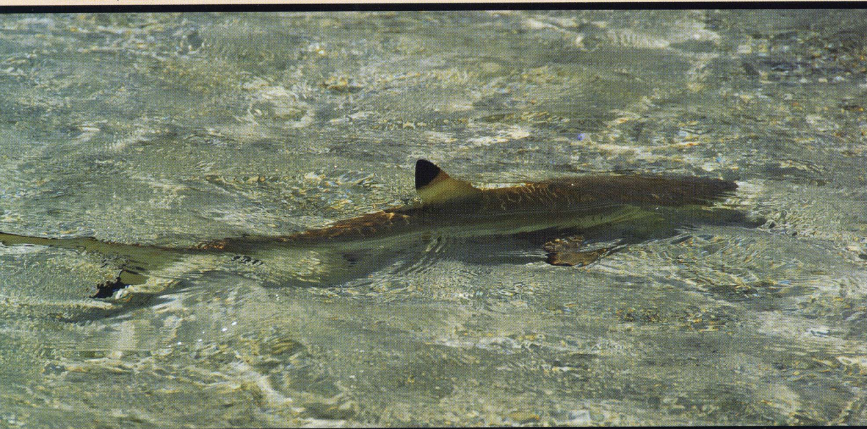
Juvenile Pacific Blacktip Reef Shark swims in the shallows at the Blue Lagoon in Rangiroa