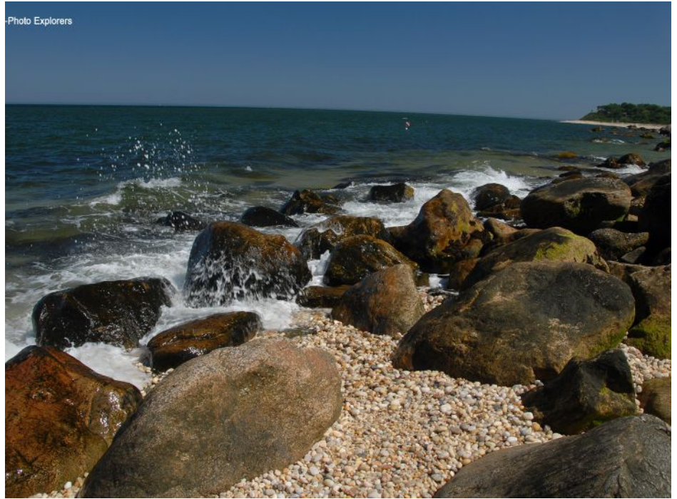
Clarke's Beach ("Secret Beach") offers great local diving in New York

In an example of how the dive community can partner with local officials to provide benefits to all, LIDA offered to give back to the Village of Greenport as part of the arrangement to provide diver access to this terrific shore dive. The first tangible outcome