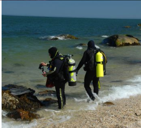
Diver's entering the water at Clarke's Beach ("Secret Beach")

By coming together to find common ground and to seek ways in which both sides of a issue can benefit, LIDA and the Village of Greenport have shown how a mutually beneficial relationship can be created. LIDA, for its part, continues to seek ways to give back to the local community, providing tangible examples of how divers can lead by example and be part of a positive contribution to the local community.