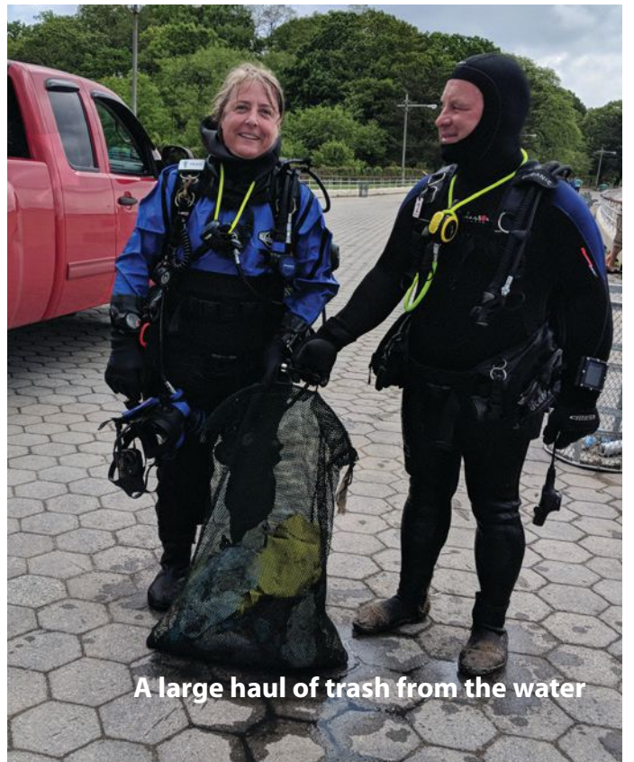
A large haul of trash from the water