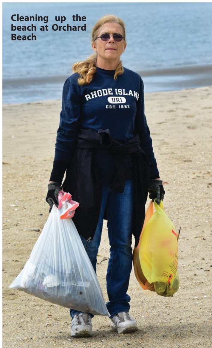
Cleaning up the beach at Orchard Beach

https://www.projectaware.org/diveagainstdebris