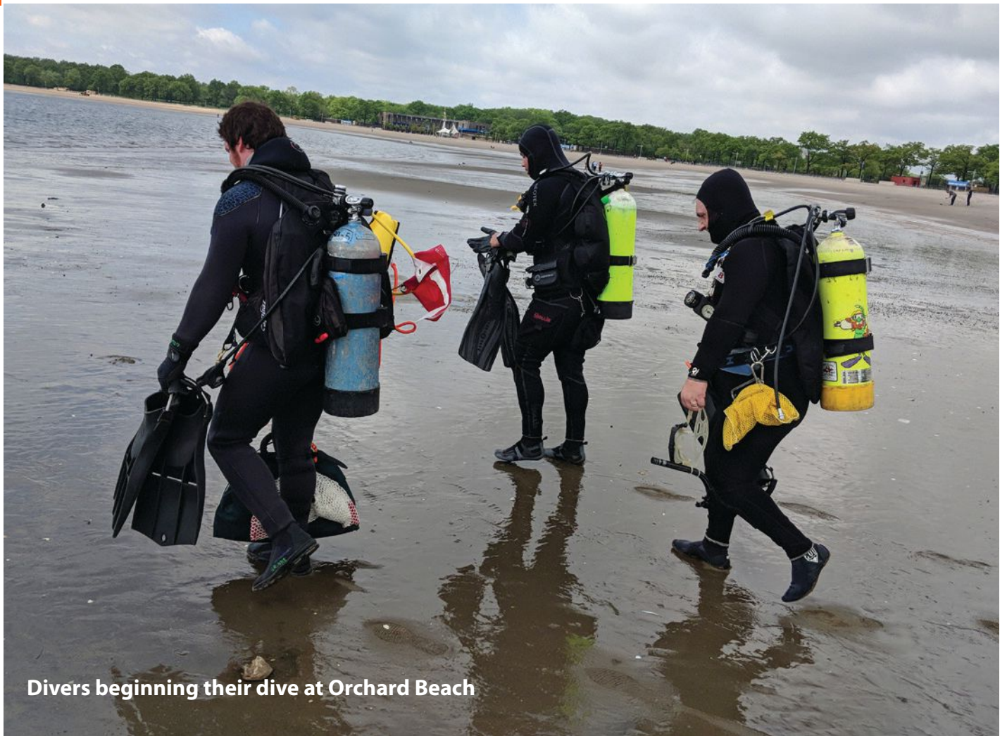
Divers beginning their dive at Orchard Beach