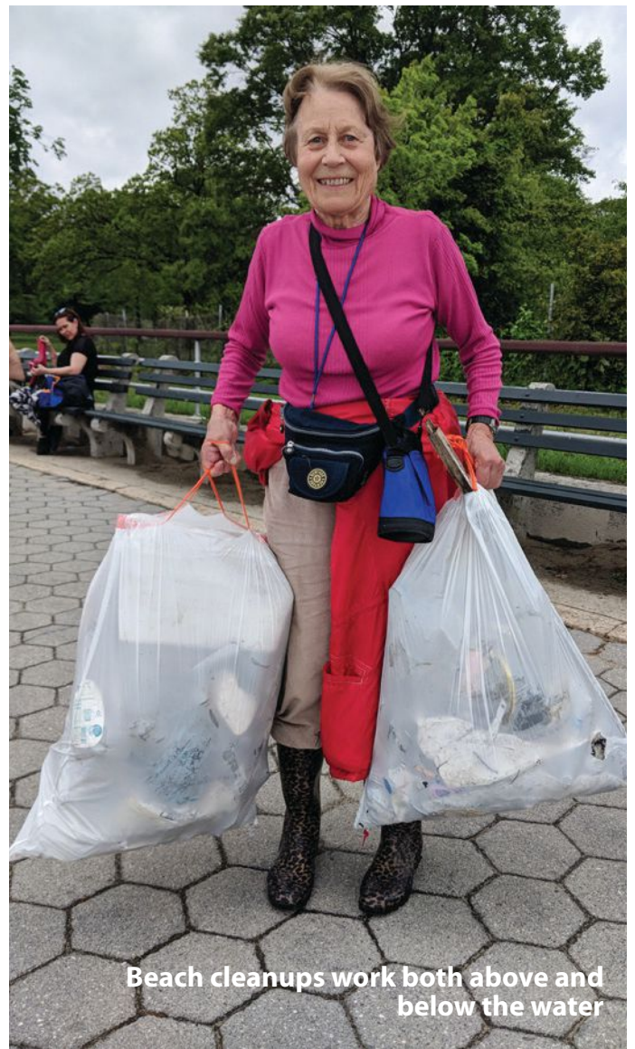
Beach cleanups work both above and below the water