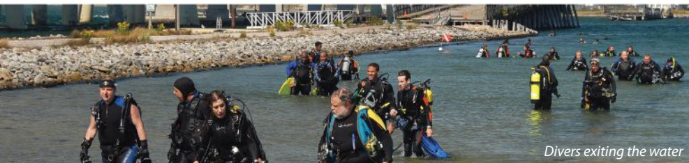
Divers exiting the water

And, as evidenced by the broad smiles and excited conversations after the dive, the Ponquogue Bridge dive with the Harbor School proved one more thing: giving back can, indeed, be fun! ■