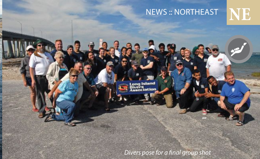
Divers pose for a final group shot