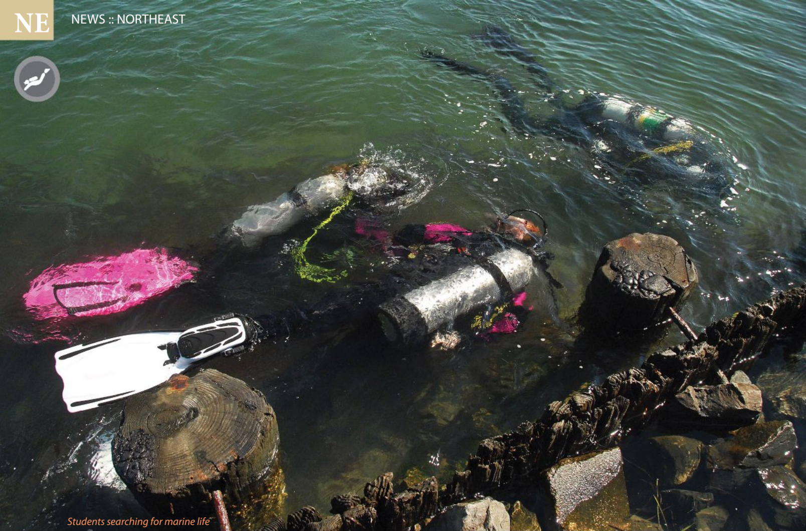
Students searching for marine life

Butterflyfish, Angelfish and other tropical species right here in the waters of Long Island.