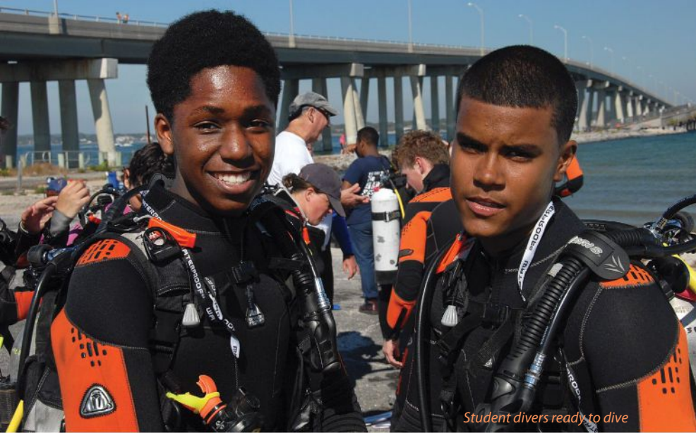
Student divers ready to dive

opportunity to give back to the students and to help inspire a new generation of divers was a powerful reason for scores of divers to join the event. Similarly, the Harbor School faculty encouraged the students to conduct a beach clean up after the barbecue, a meaningful way for the students themselves to give something back on this special day.