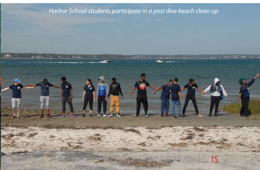
Harbor School students participate in a post dive beach clean up