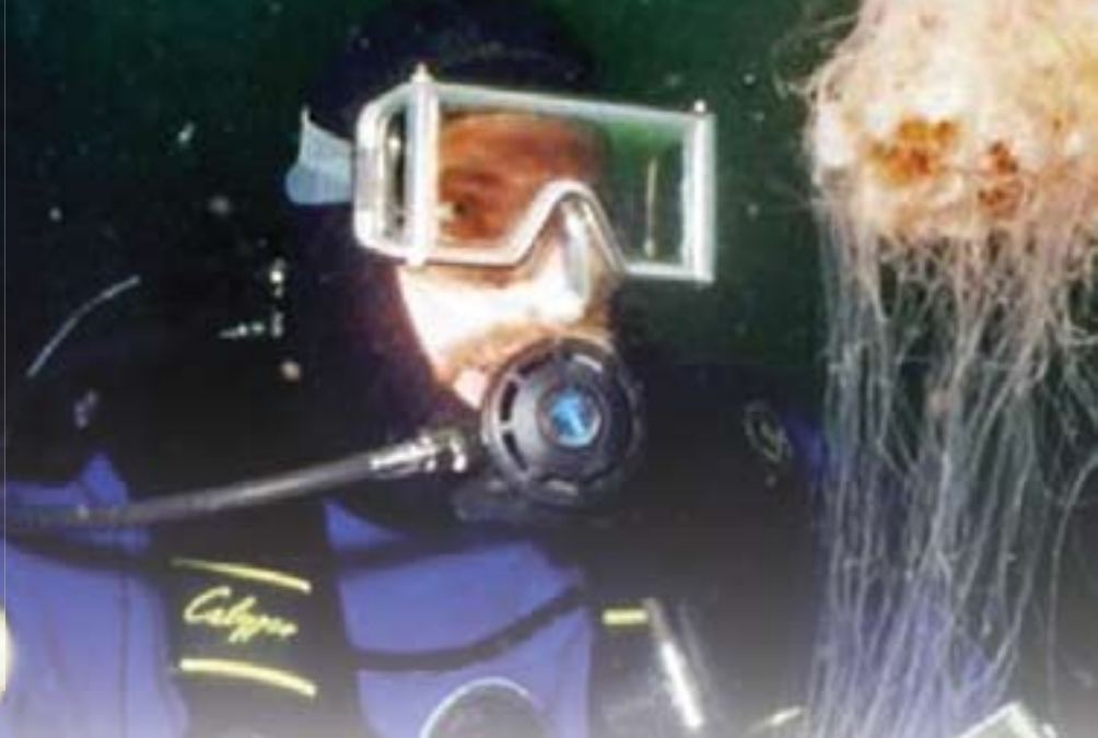
Diver takes a close look at a jellyfish.