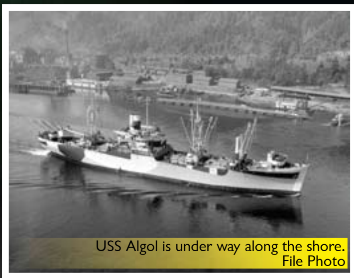
USS Algol is under way along the shore. File Photo

later, she was putting other U.S. troops ashore in the Zamabales of Luzon. The Algol also participated in and survived three amphibious invasions of Okinawa in April of 1945 without sustaining any damage to herself or loss of life.