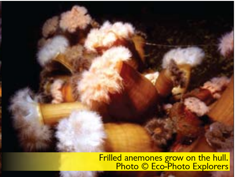
Frilled anemones grow on the hull.

her final duty as a living artificial reef, a permanent home to local marine life.