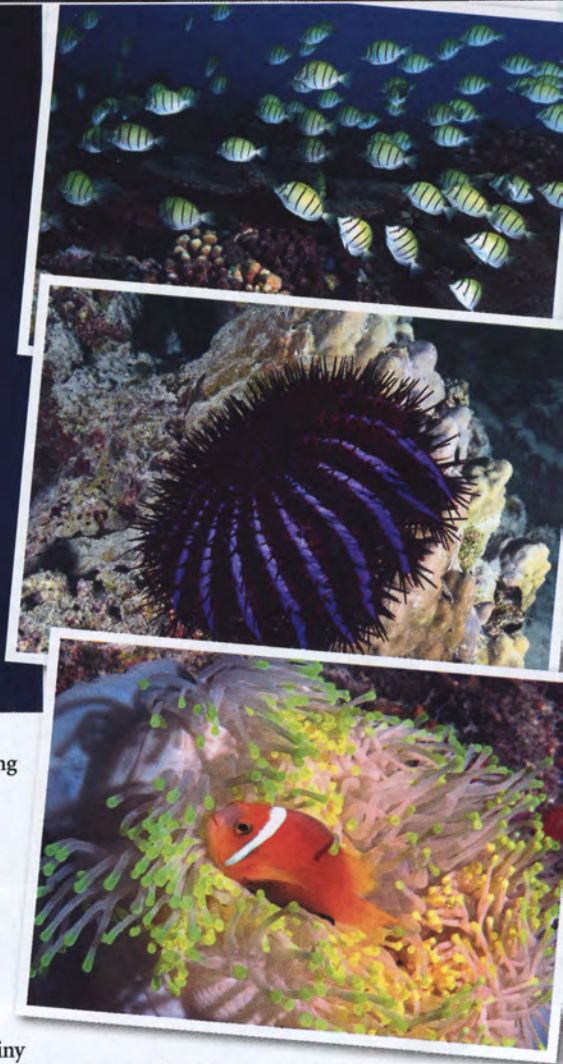
Right, from top: Convict surgeonfish often occur in vast schools that roll over the reef in search of food; a strikingly coloured starfish; Maldives anemonefish usually live in pairs or family groups.

For divers, the action is spellbinding as the predators search for food, completely unaware of and uninterested in the voyeurs. We remained fairly motionless on a sandy bottom in about 14m and watched as 70-80 nurse sharks patrolled above and countless jack sliced through the water column.