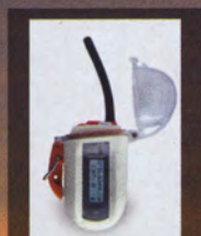
NAUTILUS LIFE LINE