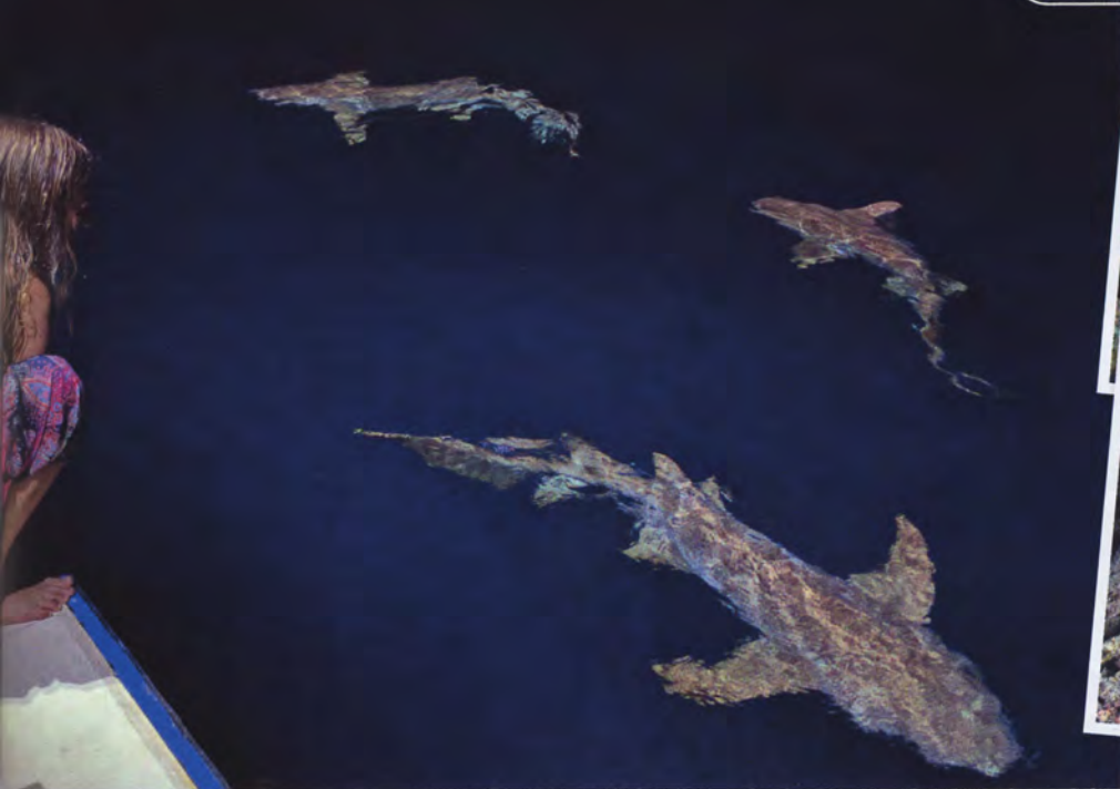
Above: Watching curious nurse sharks.