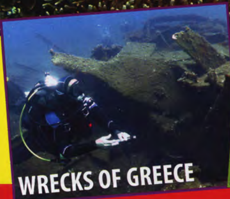
WRECKS OF GREECE