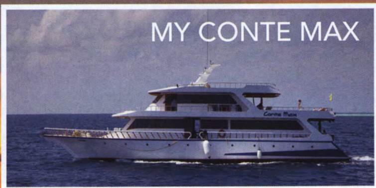
MY CONTE MAX