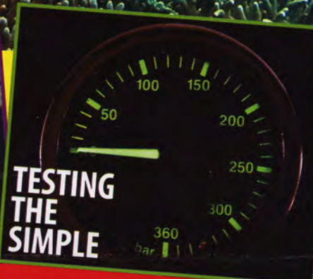
TESTING THE SIMPLE