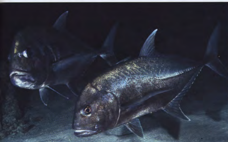
Below, from left: Jack photographed below a pier at night; a school of red-tailed butterflyfish scour the reef for food.

Pulling anchor and heading back to Male after a week of spectacular diving, we faced into a freshening wind and watched as flying fish took to the air