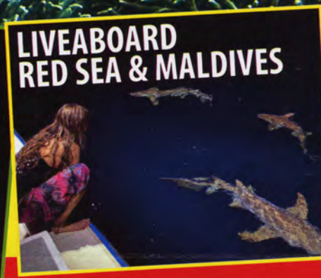
LIVEBOARD RED SEA & MALDIVES