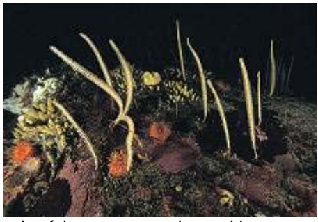
colourful anemones and sea whips

Perhaps the following question, posed in 1908 by French explorer Jean-Baptfe Charcot, captures the mystery of Antarctica: "Where does the strange attraction to the polar regions lie, so powerful, so gripping that on one's return from them one forgets all weariness of body and soul and dreams only of going back?"