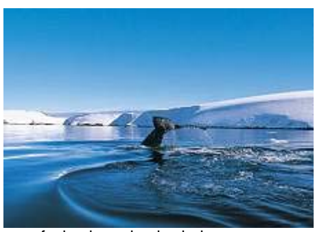
a surfacing humpback whale, recognisable from its fins, which can reach a third of body length