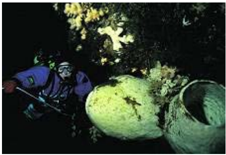
diver with giant cup sponges at 27m under 2m-thick fast ice at Cape Evans, Ross island, near Scott Base