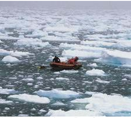
A dive tender retrieves divers from among pack ice

To dive an iceberg is to dive what appears to be a living, breathing entity. Bizarre currents can form along its edge and you find yourself suddenly sucked up or down several metres, propelled by an unseen force.