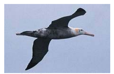
a wandering albatross