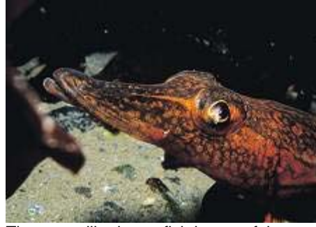
The crocodile dragonfish is one of the stranger-looking denizens of Antarctic waters