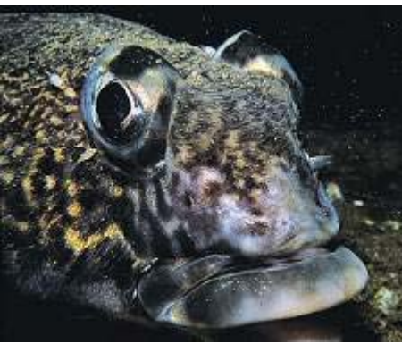
the spiny plunderfish is a bottom-dweller