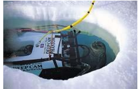
ROV and Weddell seal at the Mount Erebus glacier tongue - Weddells use their teeth to keep the ice open