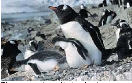
There are reckoned to be about 300,000breeding pairs of gentoo penguins in Antarctica

Tourist conduct is governed by the (International Association of Antarctica Tour