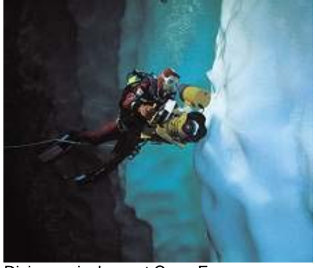
Diving an iceberg at Cape Evans