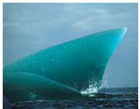
An old blue-green iceberg.

The dive is part of an underwater filming