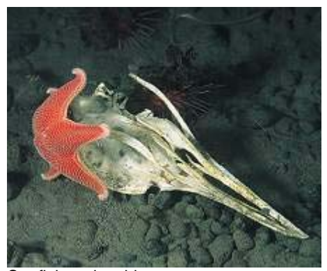
Starfish and urchins