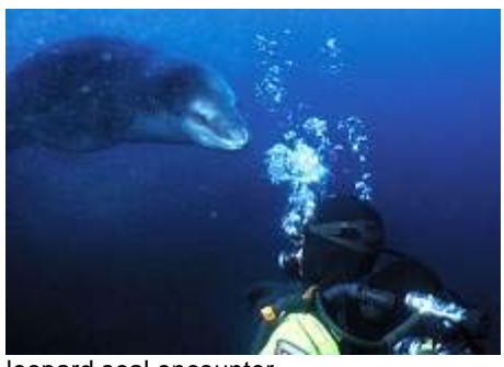
leopard seal encounter

It was almost too good to be real, with obliging penguins on the beach, some sunning themselves, some preening, many moulting, with patches of down still fluffing across their bodies.