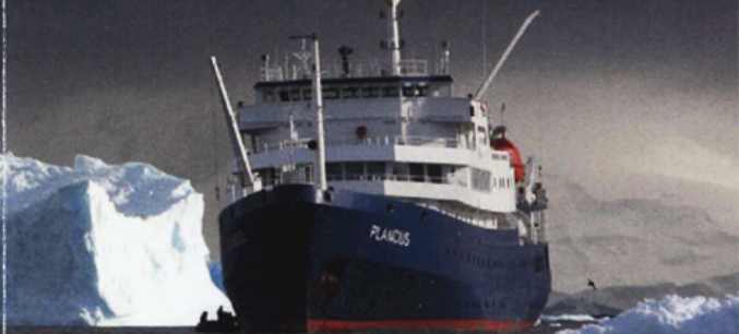
287ft. Vessel Plancius