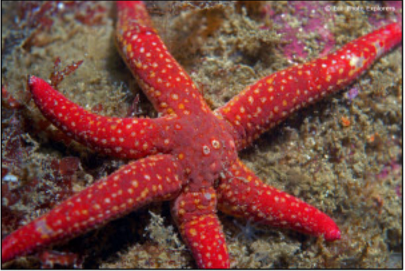
PREV 1 of 8 NEXT

Divers are explorers by nature. The desire to find new adventure, experience new environments, and explore new destinations touches us all. Sometimes this leads us to travel hours, and days, to exotic and remote locations...places our friends and families have never heard of!