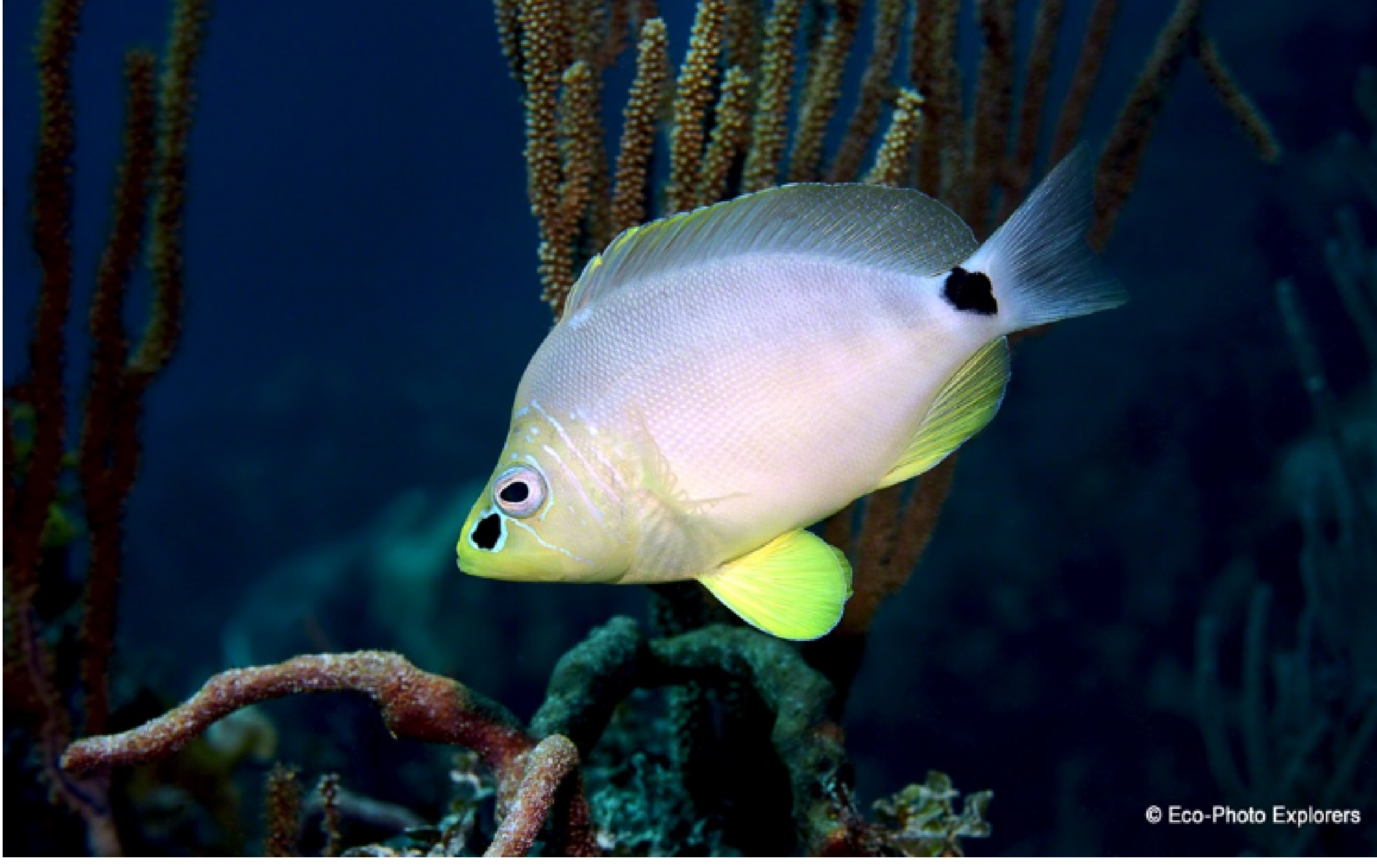
The Butter Hamlet is a shy reef dweller

This dive site is located a short distance offshore from the Hilton Hotel and consists of a fairly typical Caribbean Reef with a relatively flat topography. We descended to about 80 feet along a gentle slope which flattened out to a sandy bottom mixed with outcroppings of coral and sponge. Here we cruised the bottom searching for marine life and found Squirrelfish looking out warily from the crevices in the reef along with small schools of snapper and grunt. The reef was not visually dramatic but it was a nice introduction to the Jamaican waters and it enticed us to explore further.