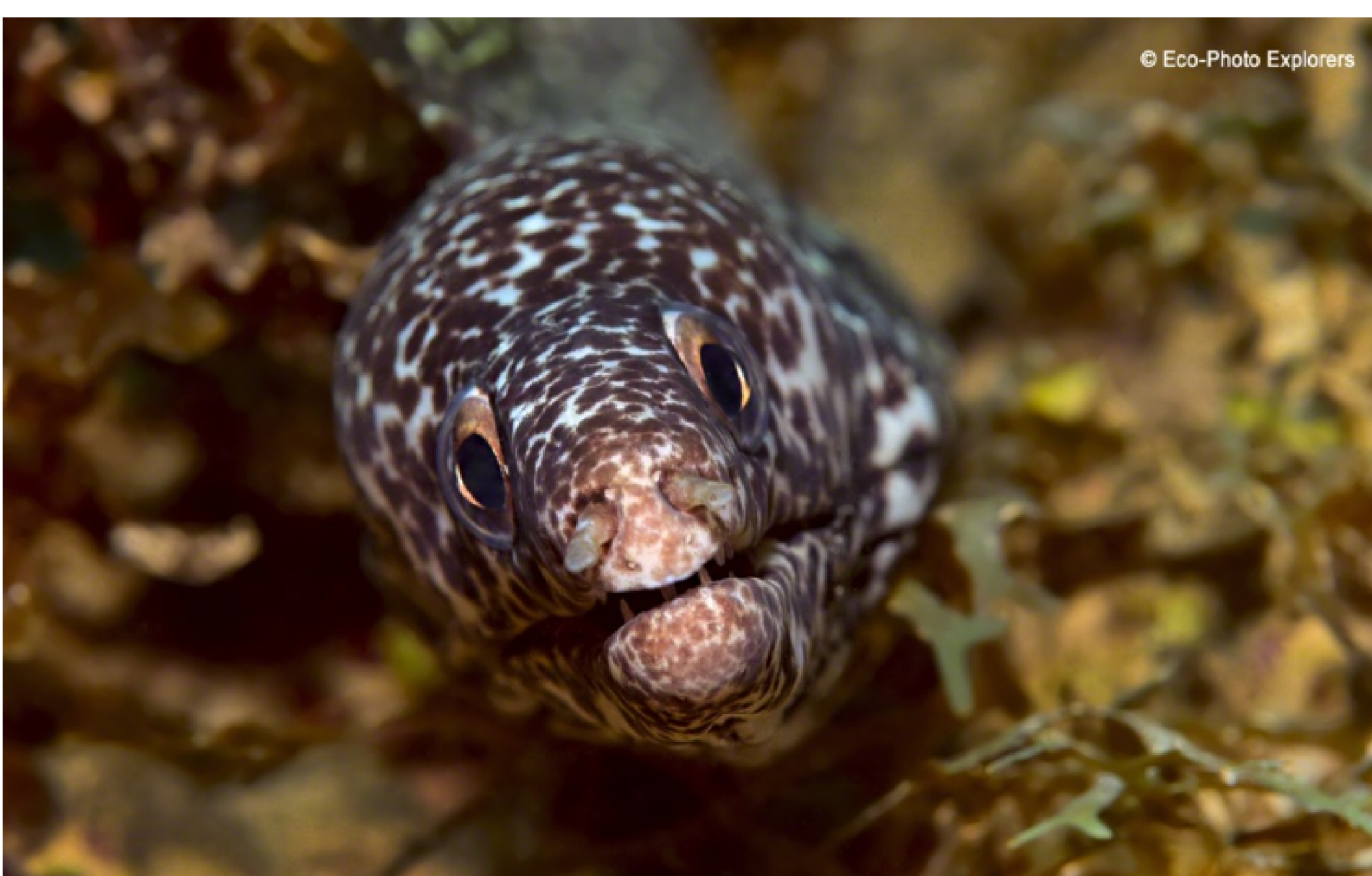
A Spotted Moray staring down the photographer

The best dive site we visited was Rose Hall Reef . Here, the reef tumbles to a manageable 60 feet and is known for towering outcroppings of coral and rock, along with some interesting swim throughs and overhangs. The fish life is typical Caribbean fare: squirrelfish, angelfish, butterflyfish and damselfish. We also came across some small moray eels peeking out timidly from their sheltered holes in the reef.